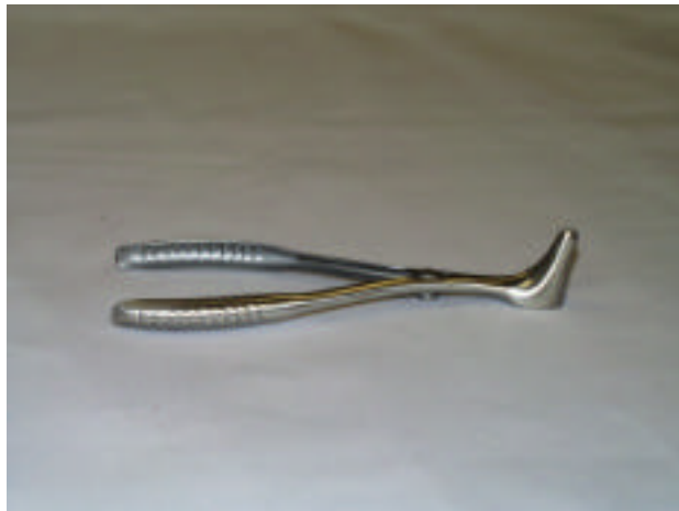
Figure 1.- Nasal Speculum.